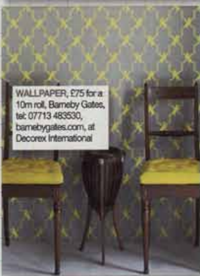
WALLPAPER, £75 for a 10m roll, Barneby Gates, tel: 07713 483530, barnebygates.com , at Decorex International

This contemporary craft fair is the perfect place to buy a one-off from an artist or craftsman. Disciplines range from ceramics, furniture, metalwork and glass to fashion accessories, jewellery and knitwear. WHEN: 22-28 September. All welcome. WHERE: Old Spitalfields Market, E1; £10 on the door, £8 in advance; tel: 0844 545 0062, originuk.org