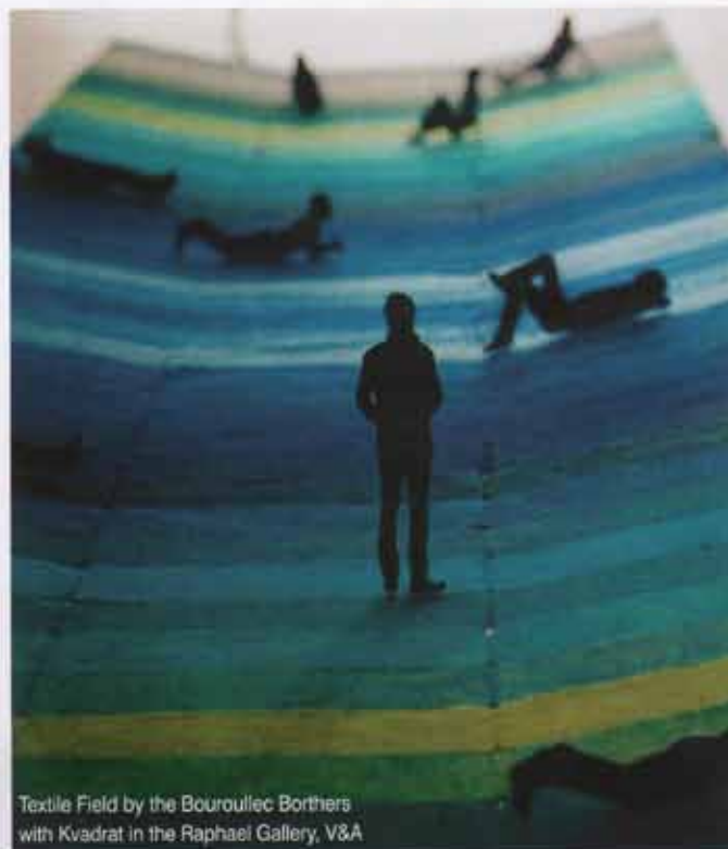
Textile Field by the Bouroullec Brothers with Kvadrat in the Raphael Gallery, V&A