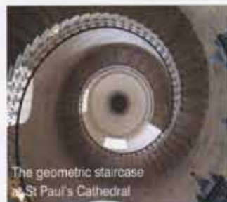
The geometric staircase at St Paul's Cathedral

A series of design-performance events supported by Google will give insights into the cutting edge of design, innovation and technology. UK Trade and Investment will host a series of market-briefing sessions, providing UK design businesses with opportunities to engage with the vast array of international visitors and interests at the London